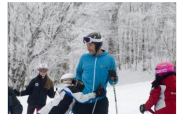
Enlarge Photo (/ski/files/images/201201/bode_trf.jpg)

And if Miller's results this season are any indication, these skis will be on fire. To contribute to TRF, please visit Turtle Ridge Foundation . http://TurtleRidgeFoundation.org